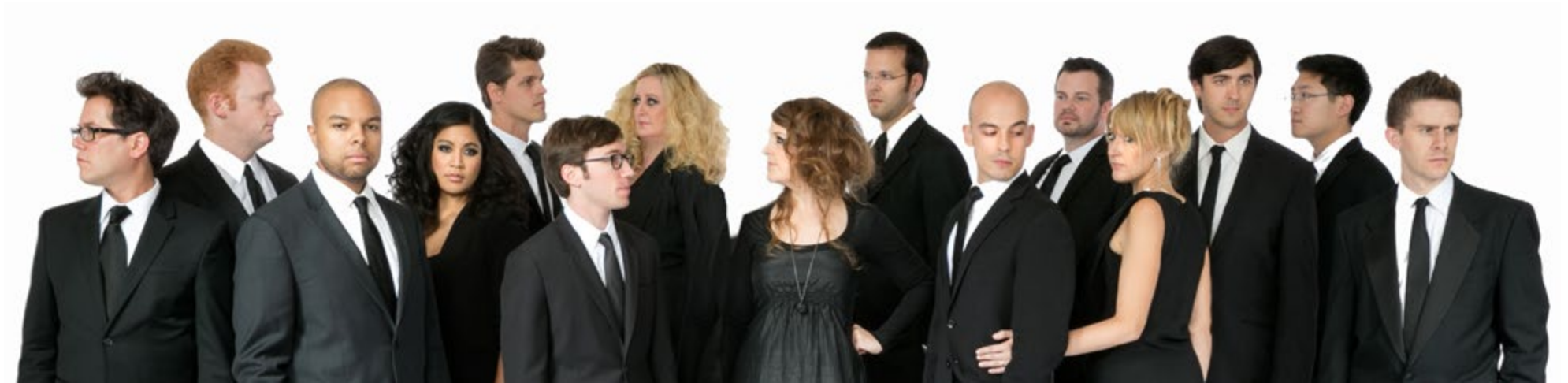
Talea Ensemble.

The composition Timelessness I: Individualism seeks to encapsulate the essence of an individual's enduring natural voice. It gradually sheds layers of collective expression, diminishing the texture with each passing moment, while simultaneously transcending the constraints of time through the preservation of distinct timbre inherent in each instrument. The entire piece is enveloped by the symbolism of the number eight, embodying the notions of boundlessness, perpetuity, and infinite possibilities.