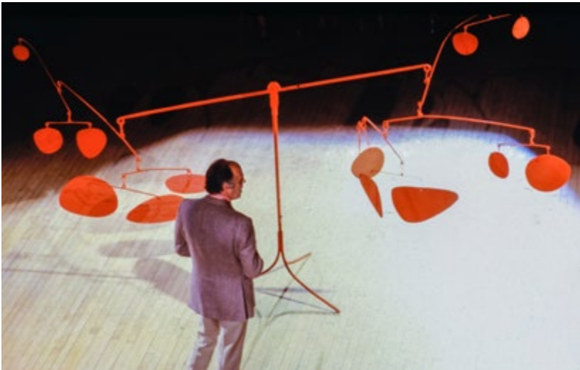
Earle Brown and Alexander Calder's Chef d'orchestre, March, 1982.