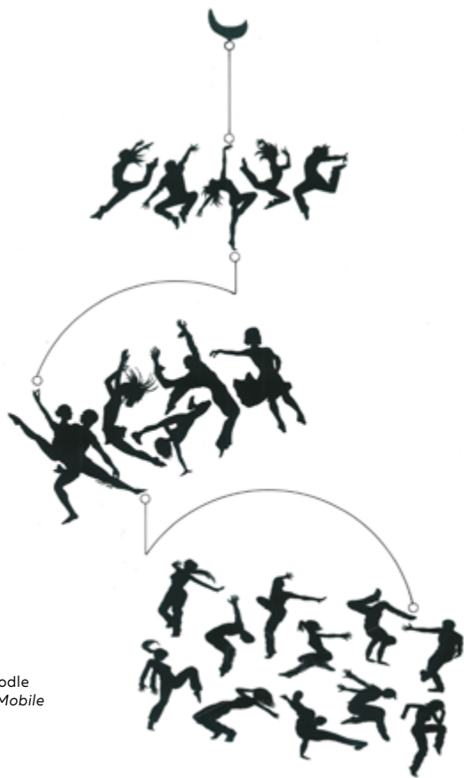
Augusta Read Thomas. Doodle illustrating form of Dance Mobile

and light, at times jazzy, at times almost Stravinsky-balletlike, at times layered and reverberating with resonance, pirouettes, fulcrum points, and effervescence. Across Dance Mobile's fourteen-minute duration, there unfolds a labyrinth of musical interrelationships and connections that showcase the musicians of Ensemble Signal in a virtuosic display of rhythmic agility, counterpoint, skill, energy, dynamic and articulative range, precision, and teamwork.