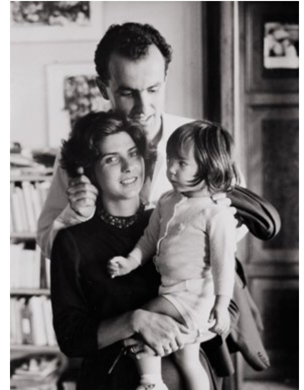
Luigi Nono and family, ca. 1961.

syllables within this fragile architecture of sound but alight on the single words that for him would seem to hold meaning. Nono often allows the vocal part to fan out in its lowest register, achieving this by adding alternating fourths and fifths as live electronic intervals. Then, suddenly, striking chords disrupt the fitful continuum of sound.