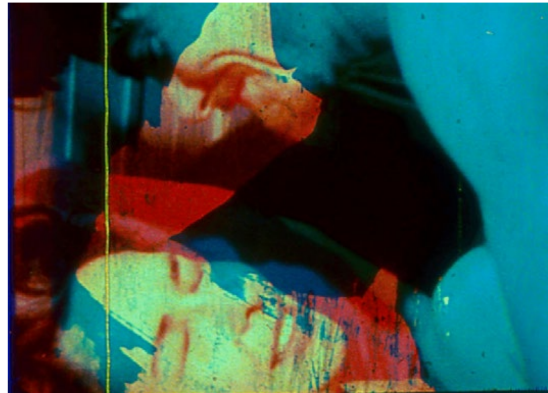
Carolee Schneemann. Video still from Fuses , 1964–66