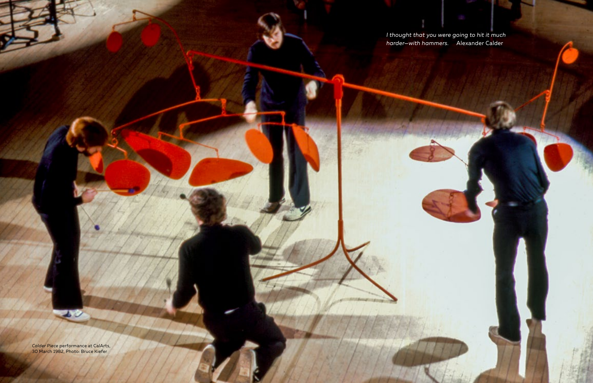
Calder Piece performance at CalArts, 30 March 1982

I thought that you were going to hit it much harder—with hammers. Alexander Calder